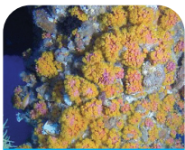
Biodiversity on infrastructure

AIMS combines data, maps, visualisations, models and business processes into applications, dashboards and tools for decision-makers. This includes decision science and the identification of regional approaches to enable efficient data gathering to inform decommissioning options.